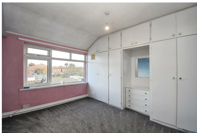
Bedroom two 11'5" x 11'2" (3.50 x 3.41 )

UPVC double glazed window, central heating radiator, fitted wardrobes, and carpeted flooring.