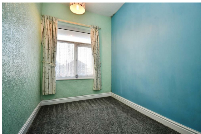
Bedroom three 9'6" x 6'0" (2.92 x 1.83 )

UPVC double glazed window, central heating radiator, and carpeted flooring.